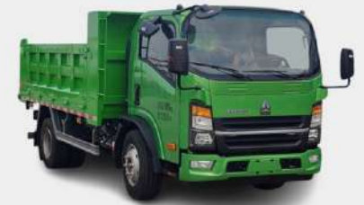
Dump Truck 4 x 2 Series Brand: SINOTRUK, SHACMAN, FAW Etc.