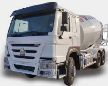
SINOTRUK HOWO Mixer Truck 6x4