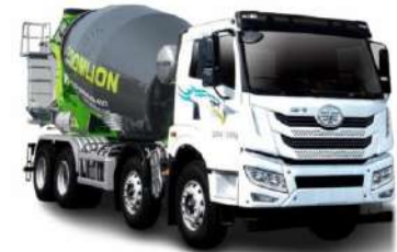
Concrete Mixer Truck Capacity: 1.5–16m 3