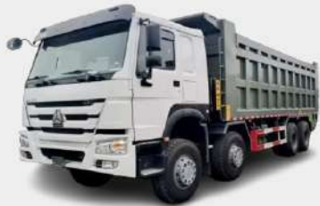
SINOTRUK Dump Truck 8 x 4