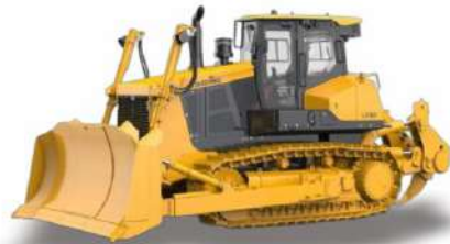
Bulldozer Operation Weight: 17 – 36 Tons Rated Power: 140 – 280 kW