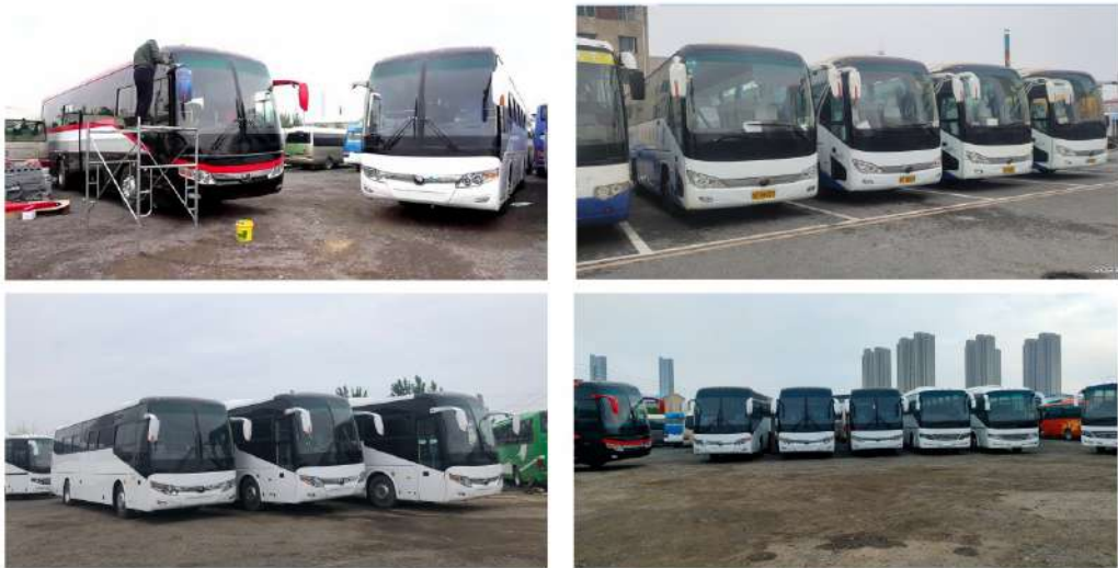
USED BUS BASE IN ZHENGZHOU CITY