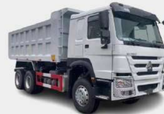
Dump Truck 6 x 4 Series Brand: SINOTRUK, SHACMAN, BEIBEN Etc.