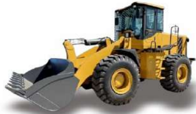
Loader Rated Load: 0.8 – 10 Tons