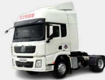
Tractor 4 x 2 Series Brand: SINOTRUK, SHACMAN, BEIBEN Etc.