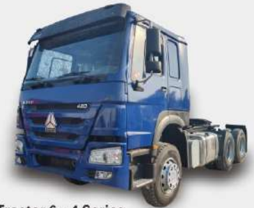
Tractor 6 x 4 Series Brand: SINOTRUK, SHACMAN, FOTON Etc.