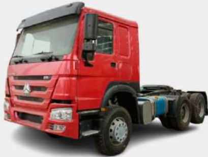
SINOTRUK HOWO Tractor