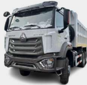
SINOTRUK Dump Truck 6 x 4