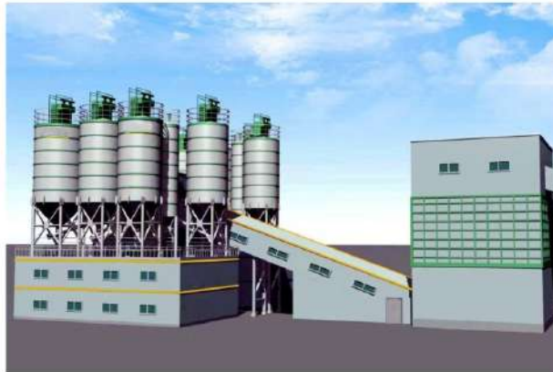
Concrete Mixing Plant Capacity: 25-240m 3 /H Type: Stationary / Mobile