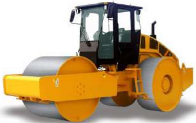
Road Roller Operation Weight: 0.8 – 40 Tons