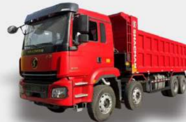
Dump Truck 8 x 4 Series Brand: SINOTRUK, SHACMAN, BEIBEN Etc.