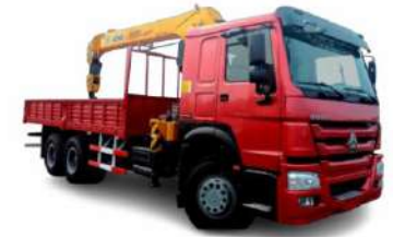
Truck-mounted Crane Max Lifting Weight: 3–16 Tons