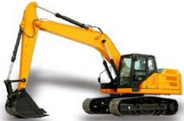
Excavator Operation Weight: 0.8 – 116 Tons