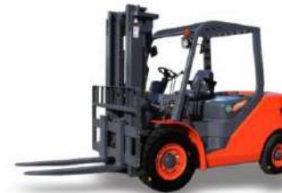
Forklift Rated Load: 1–10 Tons Type: Diesel / Electric