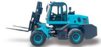
Off-Road Forklift Rated Load: 3–10 Tons