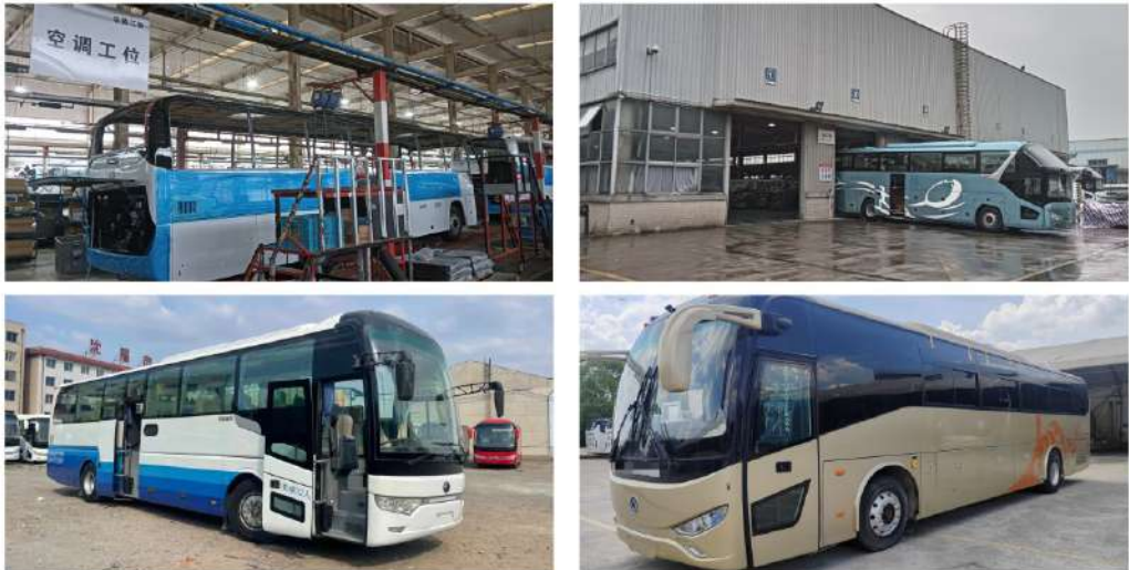
USED BUS BASE IN SHANGHAI CITY