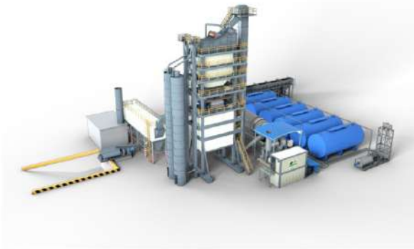
Asphalt Mixing Plant Capacity: 40-400TPH Type: Batch / Continuous