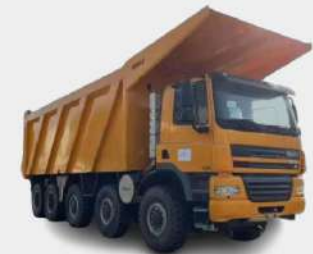
Special Vehicle Brand: SHANTUI, SEM, XCMG Etc.