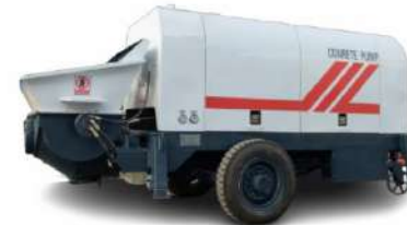
Concrete Pump Max Theoretical Through Output: 5–90 m 3 / Hour