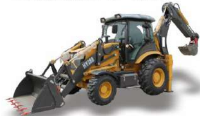
Backhoe Loader Operation Weight: 3 – 10 Tons