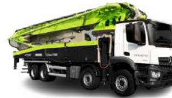
Concrete Pump Truck Height: 31–70m