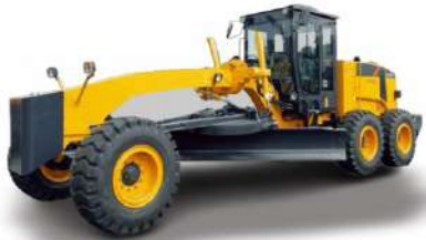
Grader Rated Power: 81 – 200 kW (110 – 270 Hp) Operation Weight: 7500 – 21000 kg