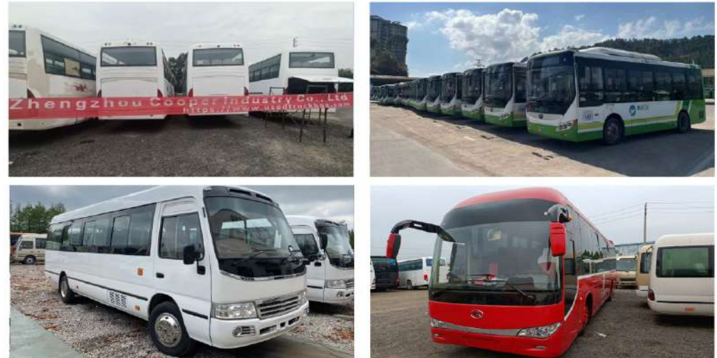
USED BUS BASE IN LANZHOU CITY