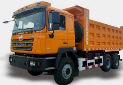
SHACMAN Dump Truck 6x4