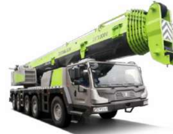
Auto crane Max Lifting Weight: 25–200 Tons