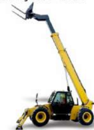
Telehandler Max Lifting Height: 7–18m