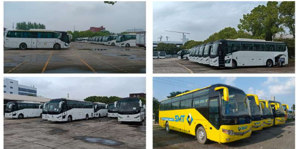
USED BUS BASE IN SHENYANG CITY