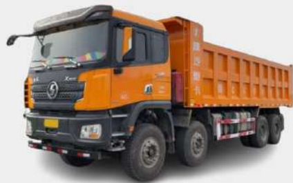
SHACMAN Dump Truck 8 x 4